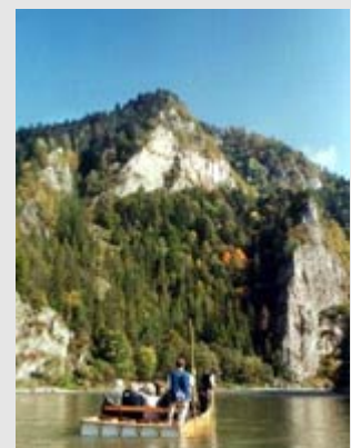
Above: Ride the river

You can hire a car to get around, but if you plan to spend most of your time in the town centre, think carefully. It is probably not a bad idea to have a car during the summer season, but in the winter, the roads are often blocked, and you'll need chains for your tyres to get anywhere.